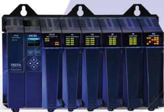
RMC200 Up to 32-Axis